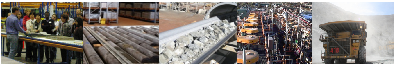
Stages of project development for geomet